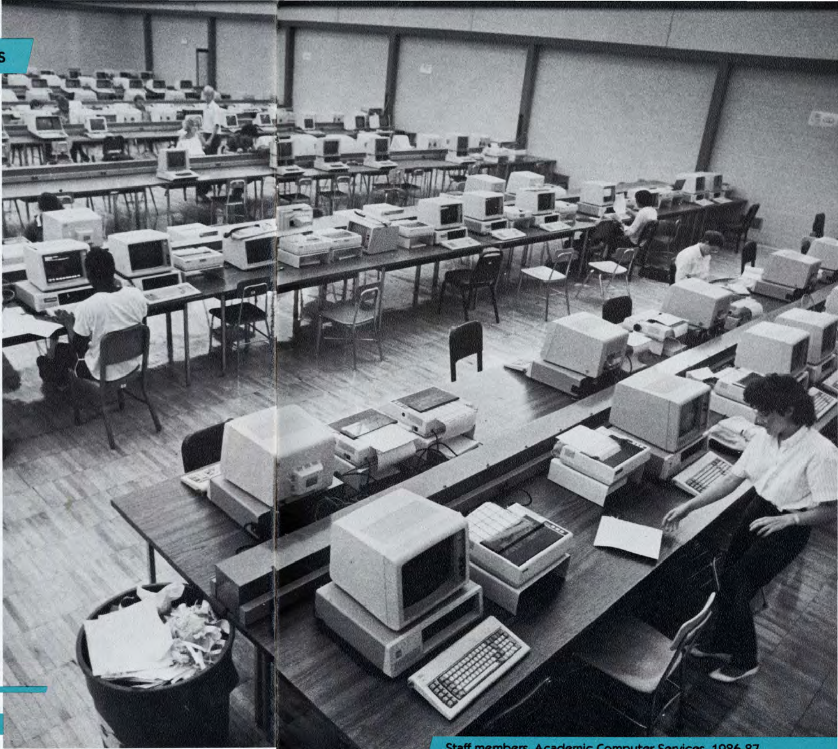
Staff members, Academic Computer Services, 1986-87