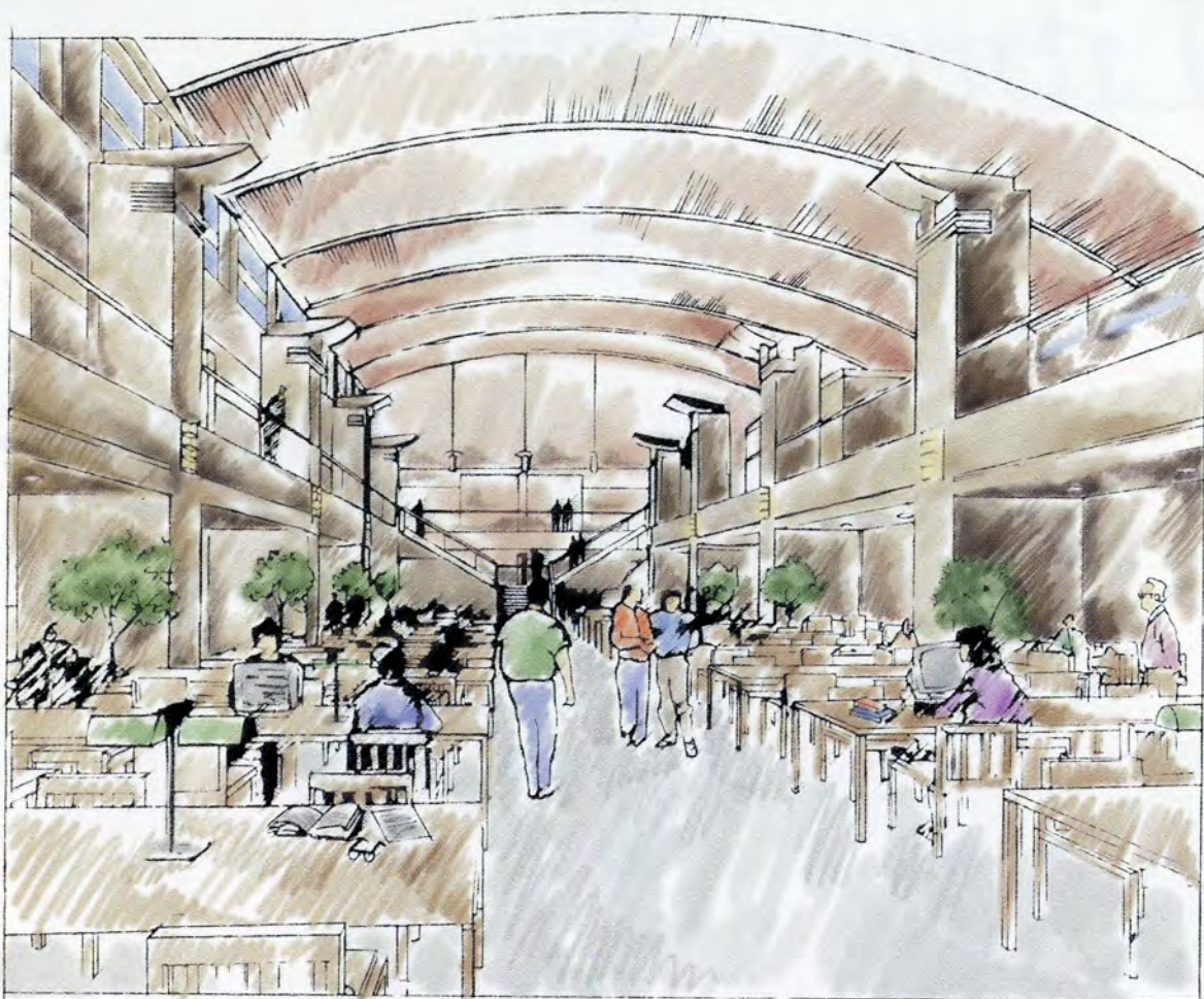
CONNECTIONS FOR USERS' PORTABLE COMPUTERS WILL BE AT EVERY TABLE IN THE NEW LEARNING RESOURCE CENTER'S SELF-SUPERVISED STUDY AREAS.

S t. Cloud State University will enter the 21st century with a new, state-of-the-art library that truly will be the centerpiece of the campus, both visually and academically. This new learning resources center is destined to become the foundation for carrying St. Cloud State to the next level of excellence and be the focal point for study, learning and the exchange of ideas. The new library clearly is the most significant project for St. Cloud State University in decades. It represents a giant step toward realizing the university's vision for the next century, continuing its tradition of excellence and opportunity.